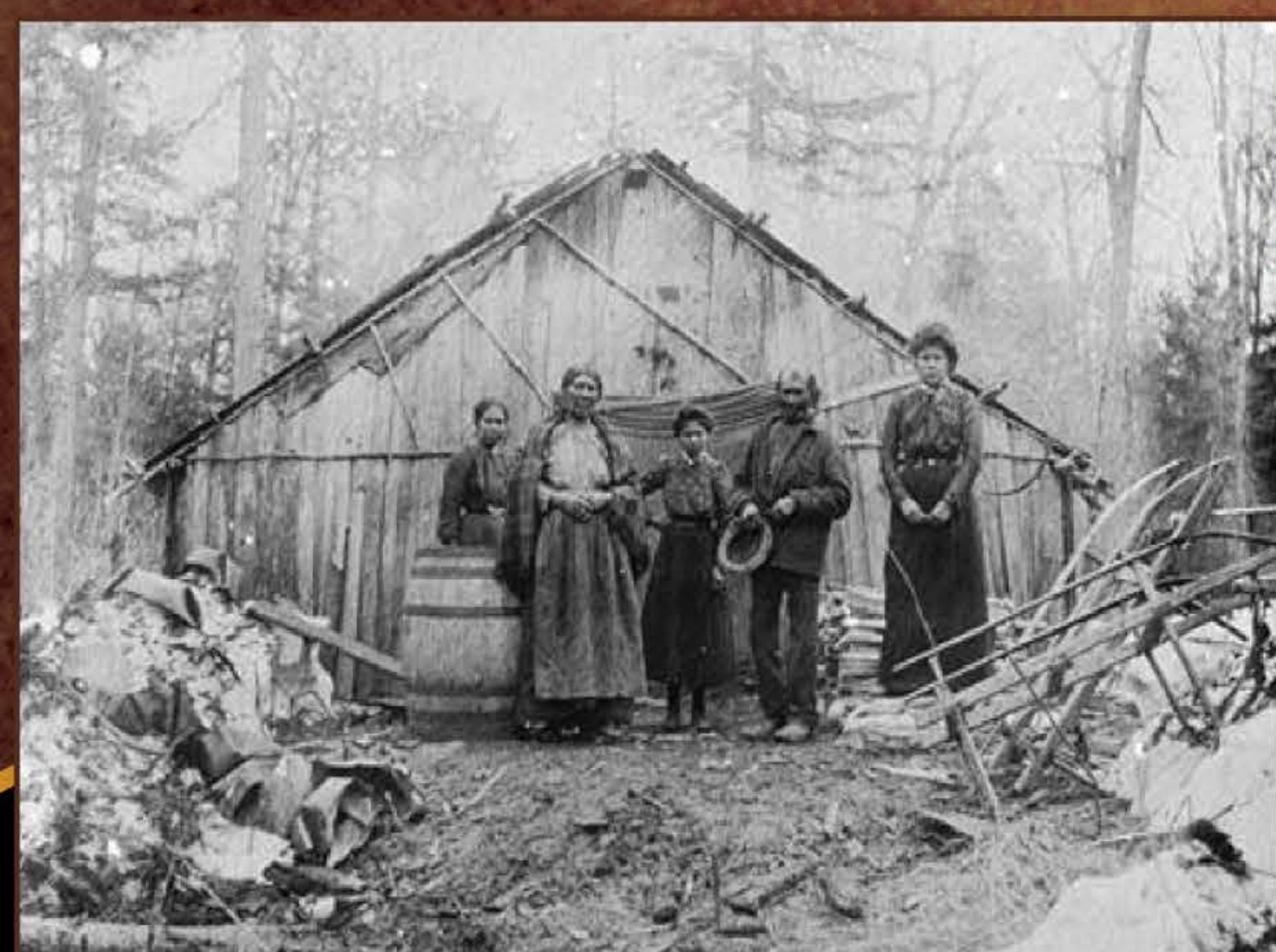
▲ Bark covered skeg-mez-eh-gay-geh-muk or sugaring house was a large structure used during the early spring for evaporating maple sap to make maple sugar, Rockland, Michigan.

Voyageurs often slept beneath their canoes and used tents as additional shelter. When erected, wedge-style tents stood 7' tall. Two vertical poles and a ridge pole formed a frame to support the canvas, and thirteen pegs driven into the ground held it taut.