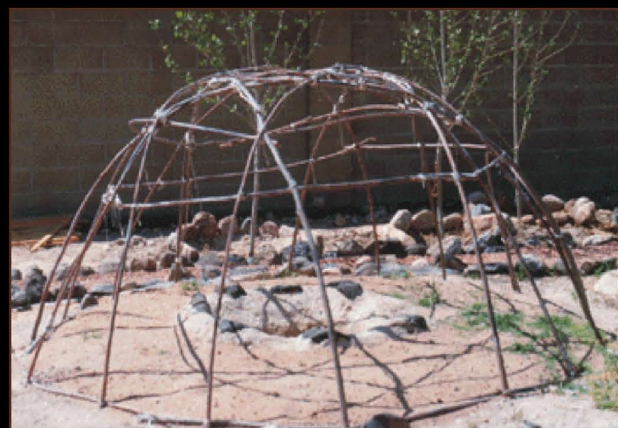
◀ Native American sweat lodge pit.

Another common special purpose structure used by native people in the western Great Lakes region was the sweat lodge. Oral histories and archaeology indicate that Neshnabe people used the sweat lodge for millennia.