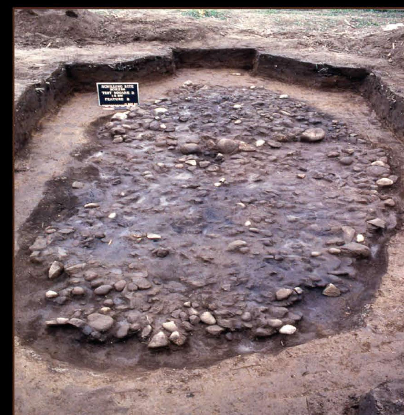
▲ Archaeologists believe this concentration of fire-cracked rock is the remains of a Native American sweat lodge at the Schilling site in Kalamazoo County. The burned wood used to heat the stones dated to 2,300 years old.