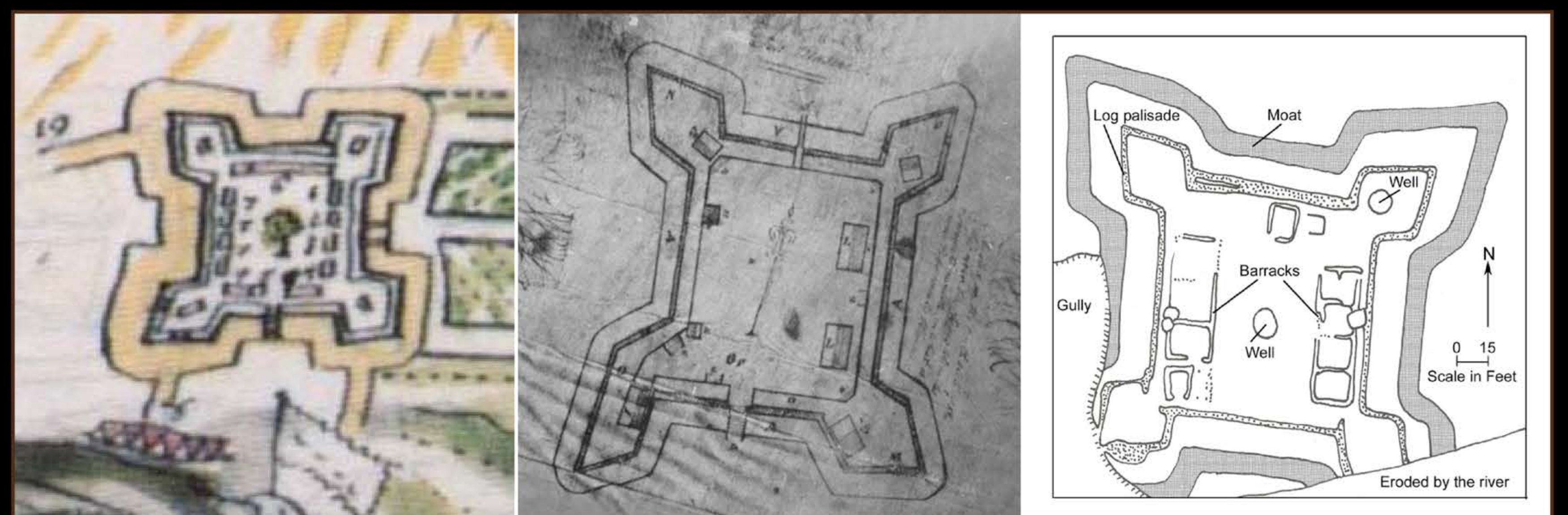
Soldier's map of Fort St. Pierre in Mississippi during the 1720s

Documentary sources indicate that Fort St. Joseph had a palisade, though it was not especially secure. In 1695, attacking Iroquois Indians put their guns through its gaps and shot into the fort. If the attackers managed to get that close to the palisade, it probably had no platforms or bastions for defensive fire. The palisade was constructed with entrances on the north and south sides.