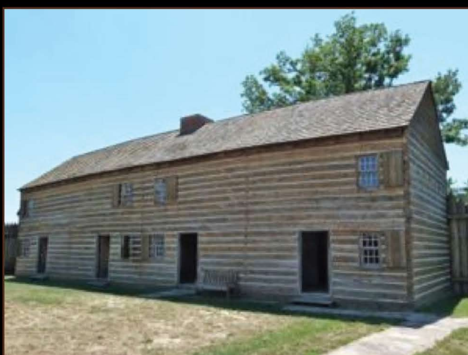
Barracks Reconstruction at Fort Massac, Illinois

Fort St. Joseph had a small garrison of soldiers. Conflicts with natives were uncommon, but the fort played an important role during the Fox and Chickasaw Wars in the 1730s and 1740s. It is not known if soldiers lived in barracks or with individual families. Excavations at Fort St. Joseph have yet to identify any military buildings, or the palisade.