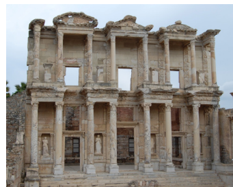
Library of Celsus, Ephesus, Turkey, completed CE 135