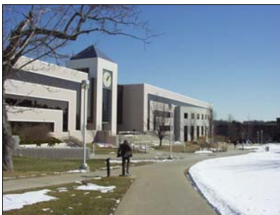
The main campus of Western Michigan University. The Geography Teaching Program is located in Wood Hall to the right of this photo.

Michigan lies in the heart of the beautiful Great Lakes Region, one of the 'wonders of the world'. Western is a great place to continue your education after graduation.