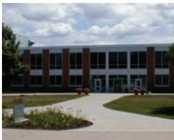
The Environmental Analysis and Resource Management Program is located in the Geography Department in Wood Hall .

F ounded in 1903, Western Michigan University has had a strong Geography program from the start. The University has nearly 30,000 students with a comprehensive variety of academic programs. Usually about 2,000 of our students come from outside the United States, representing more than 100 countries. Western is one of the U.S.'s 40 largest universities by student size, and by international student size.