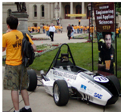
FSAE car: The WMU Formula racing team of the Society of Automotive Engineers (SAE) brought this year's entry in the 2009 Formula SAE® Michigan competition. The WMU team successfully completed all events at the competition, which requires teams to design and build a formula-style race car