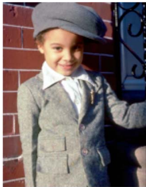
Vision Crew Future Documentary Producers

Organizations that have already committed to nominating teens from their programs for the academy include the Adventure Centre's DALT Program, ACT-SO, Bilal Islamic Center, Kalamazoo Boys & Girls Club, Fire, Kalamazoo Junior Girls Association, Portage Community High School, and Vision Crew of Worldwide Family Media Productions.